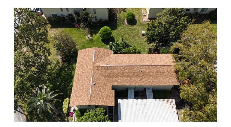
Roof Slope Roof Slope